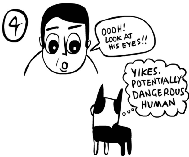
DON'T Stare him in the eye (This is an adversarial gesture)