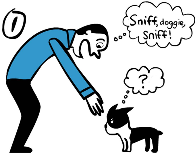
DON'T Lean over the dog & stick your hand in his face

Most people do this stuff and it stresses dogs out so they BITE! I don't care how cute you (or your kid) think Boogie is. Please show him some respect.