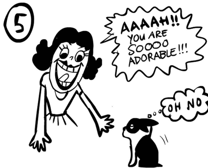
DON'T Squeal or shout in his face