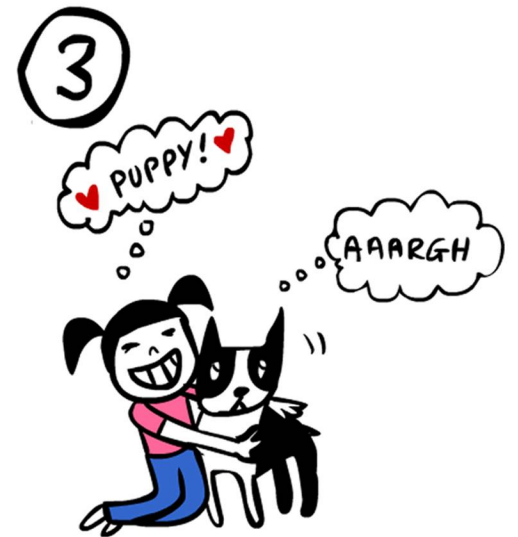
DON'T Grab or Hug him