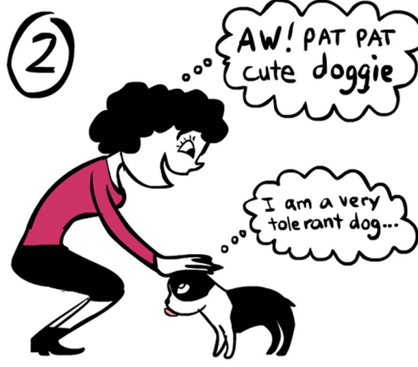
DON'T Lean over the dog & stick your hand on top of his head