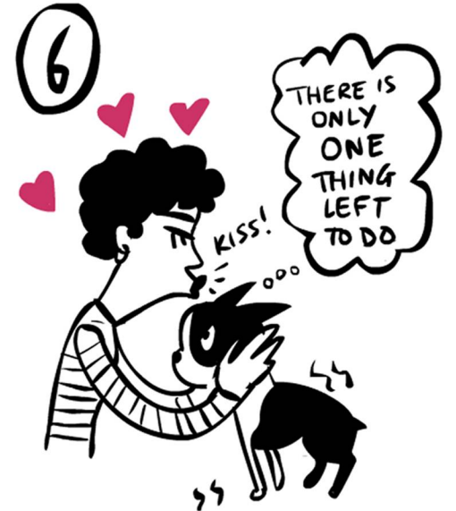
DON'T Grab his head and kiss it (This is an invasion of space)

Doing this to a dog who doesn't know you is like a perfect stranger giving you a great big hug and kiss in an elevator. Wouldn't that creep you out? And wouldn't you have the right to defend yourself?